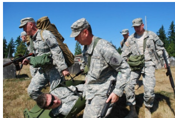
Soldiers using a SKED to transport a casualty

In order to facilitate the 361st Combat Life Saver Course a group named Tactical Element came out to train everyone. With the always changing medical field soldiers got to