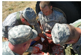
Treating a casualty

learn about the big changes in tactical medicine. Soldiers were also able to experience a more hands